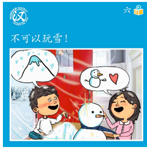
Teacher Read "I Read"