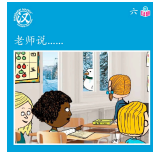
Independent Reading "You Read"