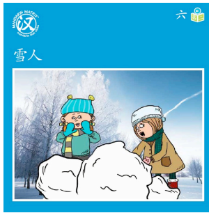
Shared Reading "We Read"